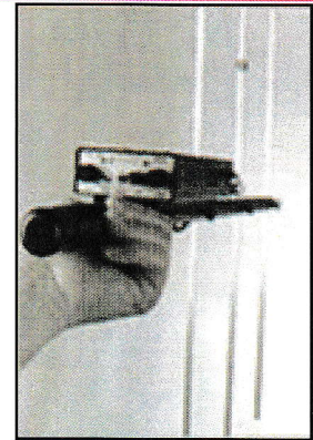
Mounted on 3 Element folding Antenna